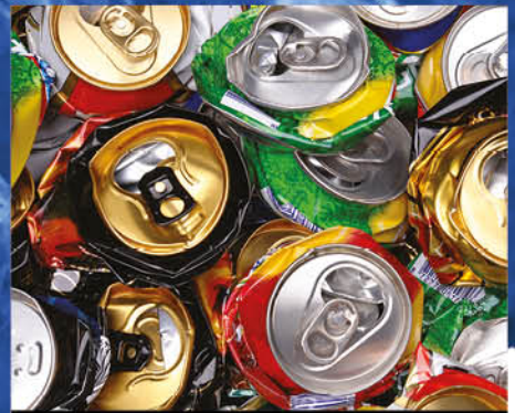
Steel & aluminium cans