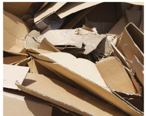
Cardboard & paper

Start managing your waste better: 0345 337 0000