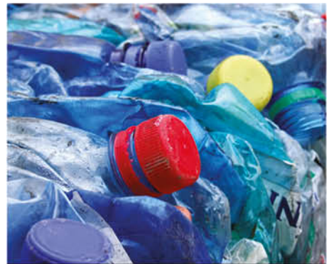
Plastic films & bottles